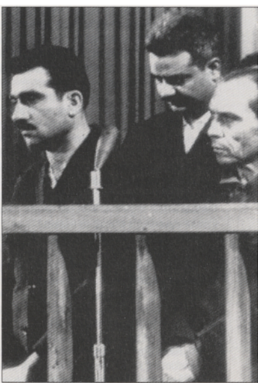
Kamel Amin Sa'bet was arrested in 1965 and tried without counsel.

He managed to expose Syria's plans to cut off Israel's water supply by diverting the headwaters of the Jordan. He also provided the details of a plan drawn up by the Palestinian National Liberation Movement continued on page 62