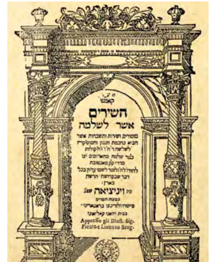
Rossi's 1623 Songs of Solomon manuscript.

Monteverdi moved to Venice in 1613. While Rossi kept his position at the court, conditions for Jews gradually deteriorated, and it is thought that our lack of information about either Rossi or his sister after 1630 indicates that they perished in the Austrian sack of the Mantuan ghetto that occurred that year.