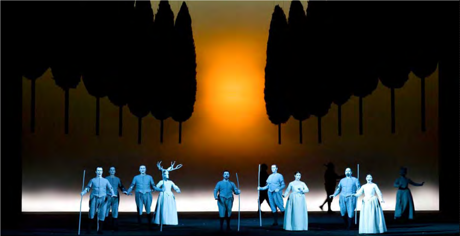
“L’Orfeo” performed at the Opera La Scala, Milan, Italy.

THE BEST OF JEWISH MUSIC, ENTERTAINMENT AND CREATIVITY