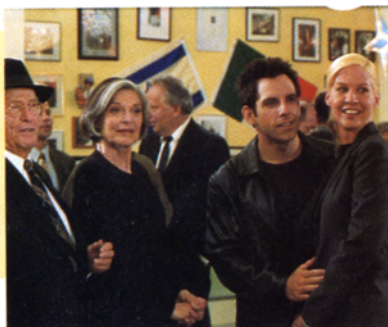
RODOR ANENAVIVRINE ESSTW445

—Ruth Schram (played by Anne Bancroft, second from left) in Keeping the Faith