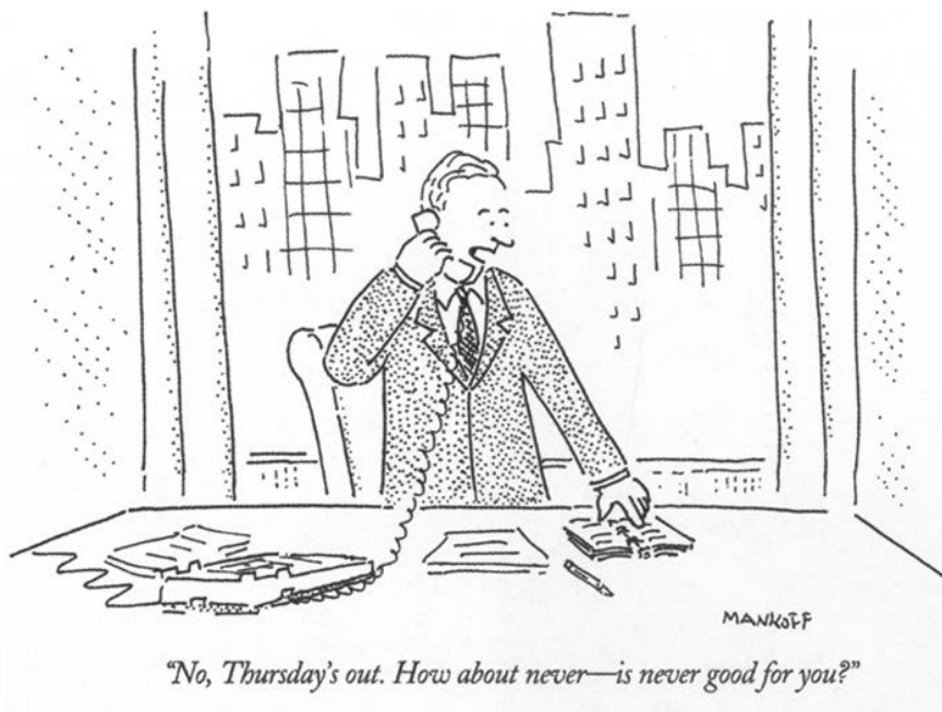
"No, Thursday's out. How about never—is never good for you?"

the strange behavior of a person like this was called "a man of humor." The term, of course, evolved over time but that's its origin.