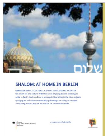
German Information Center